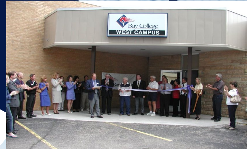
Cable Contractors Building In 2003