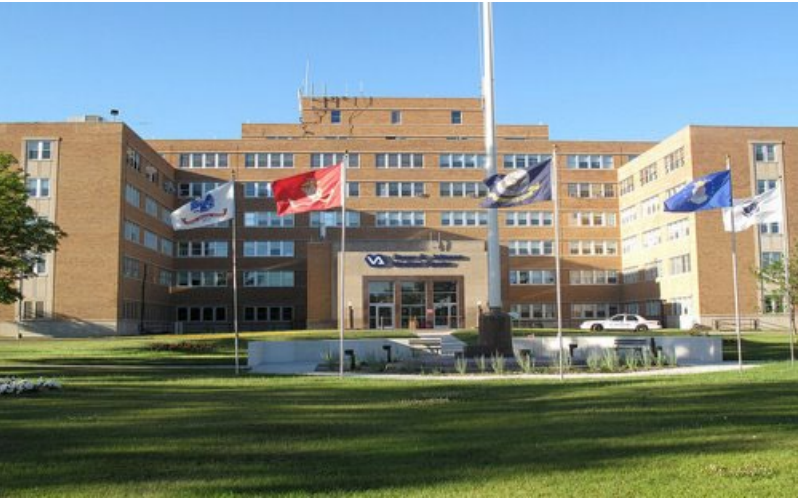
VA Hospital Clinical Nursing Classes in 1977