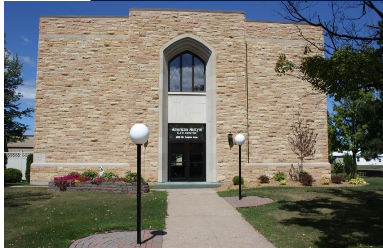
American Martyrs Catholic School in 1987